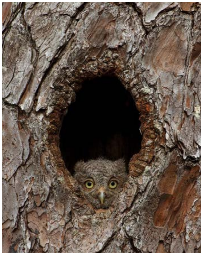
2016 Second Place: First Peek – Eastern Screech Owl Locale where photographed: Withlacoochee State Forest

The Chertok Photo contest is open to all photographers (except members of OAS'