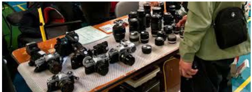
One photographer's trash is another photographer's treasure.

Go to the Orlando Camera Club Website http://www.orlandocameraclub.com/ . You will have to log in and go to the Competitions link, located in the Member Area drop down menu. You will have to register to be eligible to enter images into the competition.