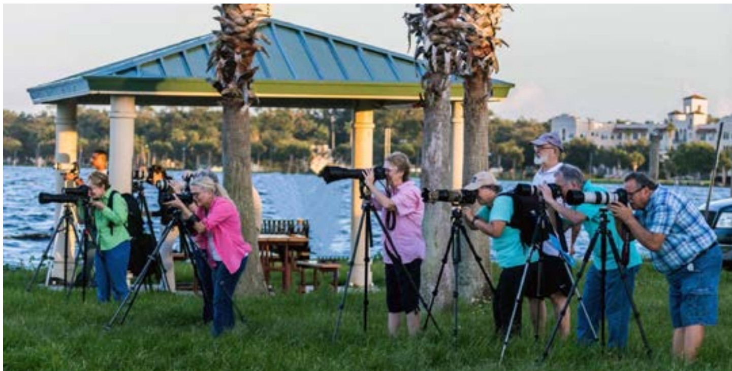
OCC Photographers converged on Lake Monroe in Sanford for the October Shoot-out of the Wednesday night Rum Races. After the race everyone moved over to the marina to catch the sunset before meeting at the Sanford Brewing Company to share stories.