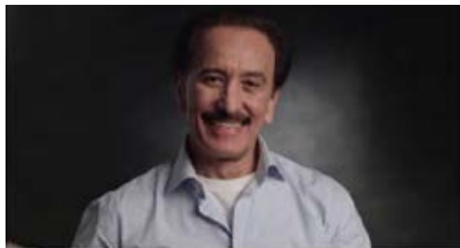
Sunday March 11 th , 2018