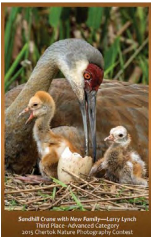
Sandhill Crane with New Family—Larry Lynch Third Place—Advanced Category 2015 Chertok Nature Photography Contest