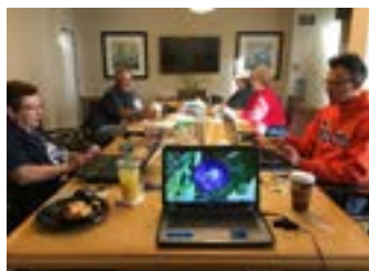
A few of the OCC volunteers finishing up on the last day.