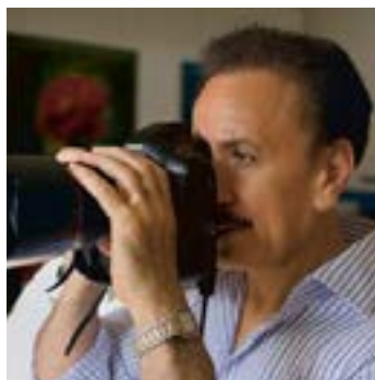
Parish Kohanim Keynote Speaker, Speaker Sessions