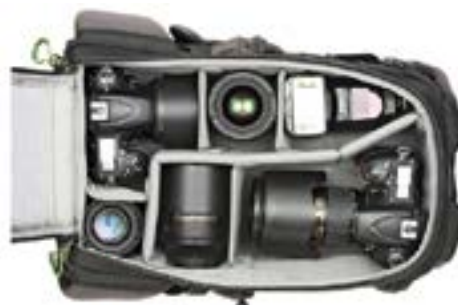
Fits two gripped DSLRs with lenses attached and one to three standard zoom lenses