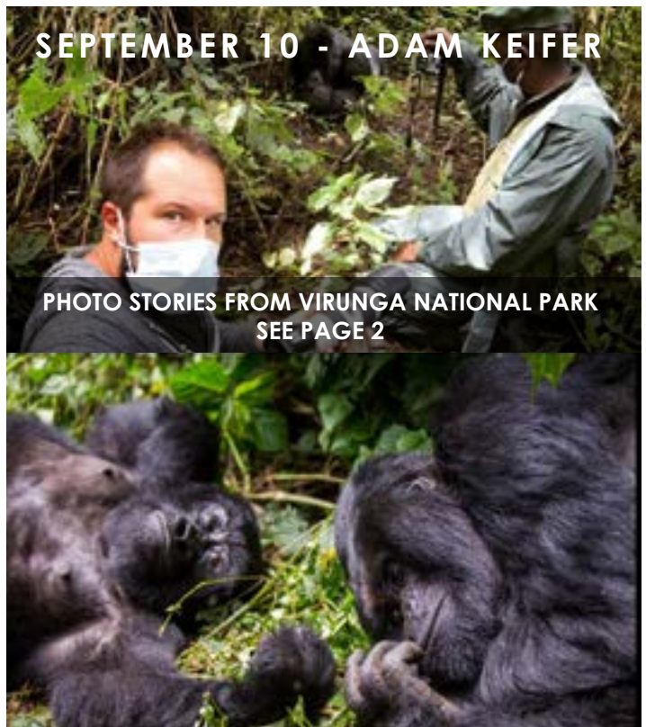
PHOTO STORIES FROM VIRUNGA NATIONAL PARK SEE PAGE 2