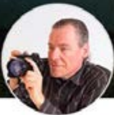
Photo by Olympus Visionary Peter Baumgarten with the E-M1 Mark II | M.Zuiko Digital ED 12mm F2.0