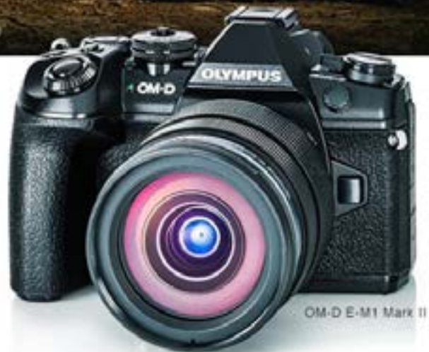
OM-D E-M1 Mark II

WHERE Marks Street Senior Center WHEN 1/14/19 - 6:15PM – 8PM