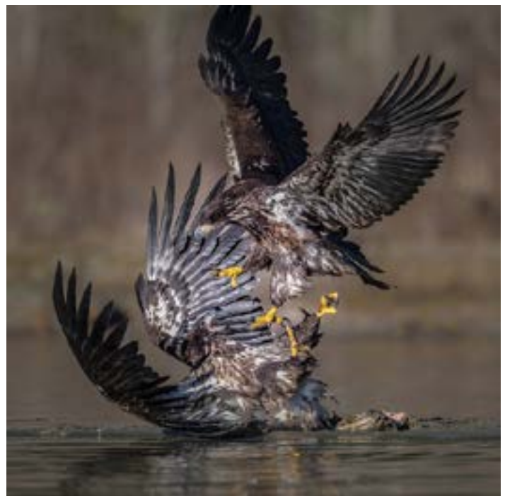
That's My Old Rotten Salmon

Shara Abel has three of her pieces, Morning Escape, Ghost Train & Serenity in the Woods selected for the Focus on Florida Osceola Juried Art Show . Out of over 300 entries 80 were selected. Congratulations, Shara.