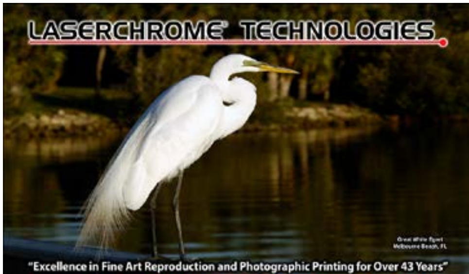
Great White Egret Melbourne Beach, FL

"Excellence in Fine Art Reproduction and Photographic Printing for Over 43 Years"