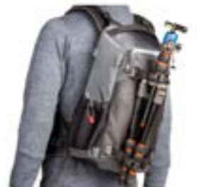
Tripod carry with included straps

Club Members: Use this link when ordering to support our club.