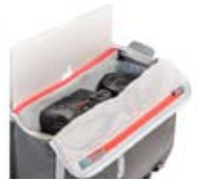
Dedicated 13" laptop pocket is padded