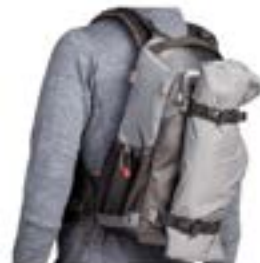
Jacket carry with included straps