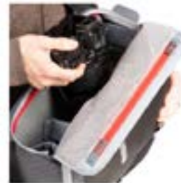
Extra-large side panel gives you complete access to all your gear

The PhotoCross is built to withstand the elements, yet comfortable enough to wear on long days in the field. The extra-large side access point gives you complete access to your gear when you're ready to take the shot.