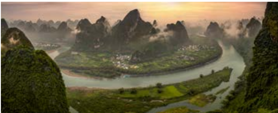
A SAMPLING OF EDWIN'S PHOTOS.