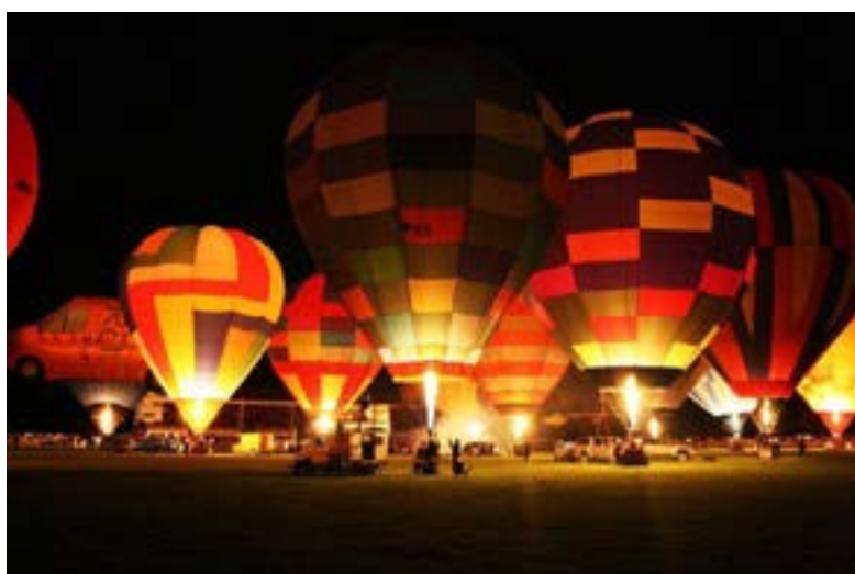
MAR 25 AT 3 PM EDT – MAR 26 AT 9 PM EDT Orlando Balloon Festival 2021 Free · Blue Jacket Park