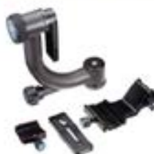
Sirui PH20 Gimbal Head 20% Off