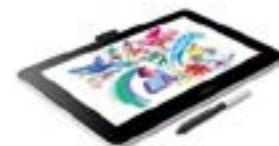
Wacom One Creative Pen Display $100 Off