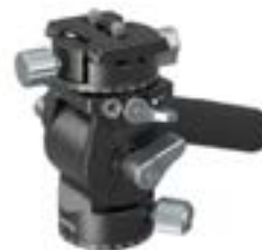
Small Rig Fluid Head $40 Off