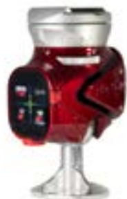
Platypod Elite 10% Off