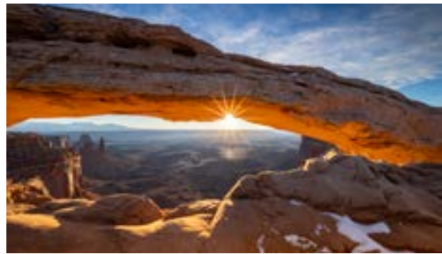
Mesa Arch - Canyonlands NP

A past January I went on a photo trip to The Grand Tetons. This past January, I did a trip to Utah to visit Arches and Canyonlands National Parks. The temperatures were between 30 and 50 degrees. It was comfortable as long as you dressed in layers. The base location for this trip was Moab, Utah. Many of the National Parks now have a reservation system. between April and October due to the crowds.