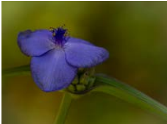
theme is "Macro".

Submissions for the April competition are open from February 28th until Friday, March 31 at 11:59 pm. The