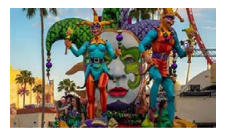
UNIVERSAL'S MARDI GRAS: INTERNATIONAL FLAVORS OF CARNAVAL Universal Studios Florida 6000 Universal Boulevard Orlando, FL 32819

What's even more exciting than Mardi Gras? Universal's Mardi Gras! We're going beyond the bayou with an awesome party inspired by Carnaval celebrations from around the world. Watch parades (on select nights) of spectacular floats. Sample flavors from the bayou to Brazil and beyond. Enjoy live music all around and concerts (on select nights), then go ahead and get your beads and your party on!