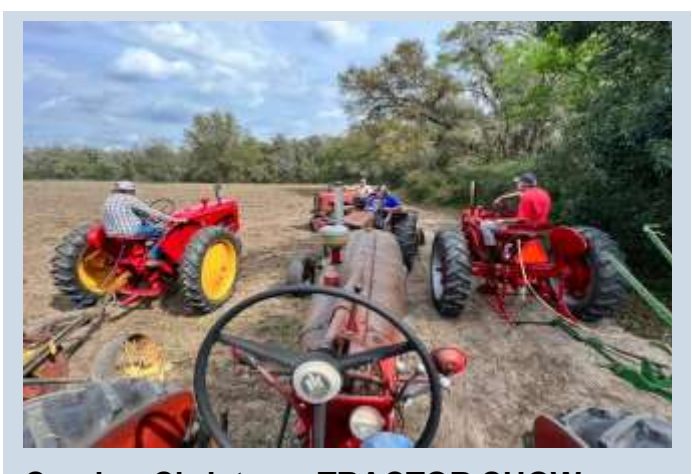
Cracker Christmas TRACTOR SHOW Sat. Dec 2 -3, 2023, 11:00 am 1300 N. Fort Christmas Road Fort Christmas