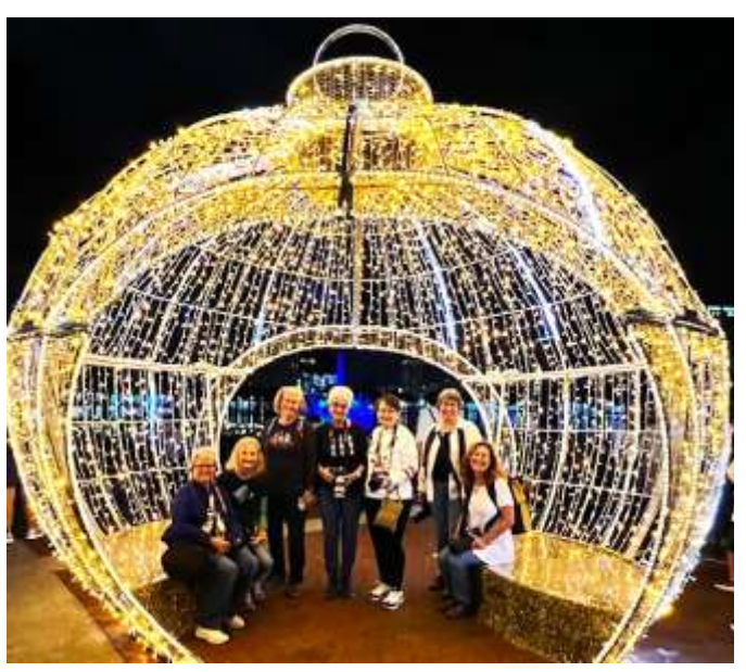
Field trip in December to Lake Eola and Violectric Concert.