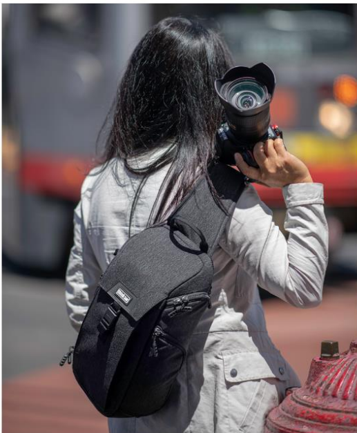
Urban Access 8 Sling