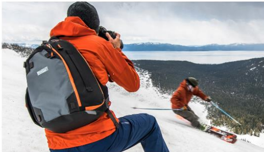
PhotoCross 13 Sling.