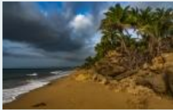
2 nd - "Serenity" By Ruben Rodriguez