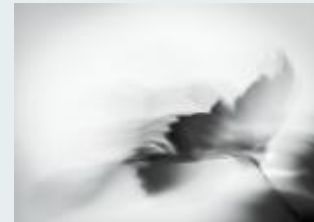
3 rd - "Serenity" by Randy Seaman