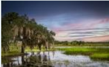
1 st - "Lowland" by Randy Seaman