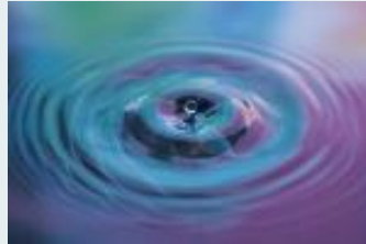
2 nd - "Concentric Circles" by Ansa du Toit