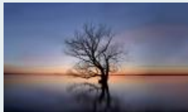
2 nd - "At a Standstill" by Armand Gelinás