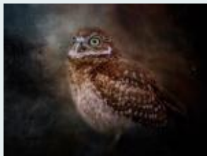
1 st - "Reflection" by Pat Husband