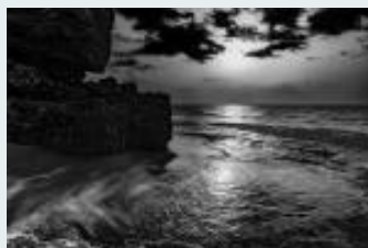
2 nd - "Contentment" by Ruben Rodriguez