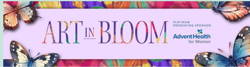
Art in Bloom in Orlando at the Orlando Museum of Art (OMA)