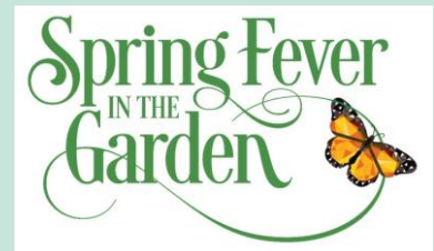
Spring Fever in the Garden | Winter Garden, FL | 18892