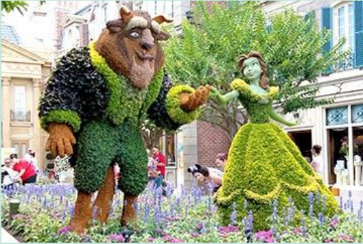
EPCOT International Flower & Garden Festival | Walt Disney World Resort