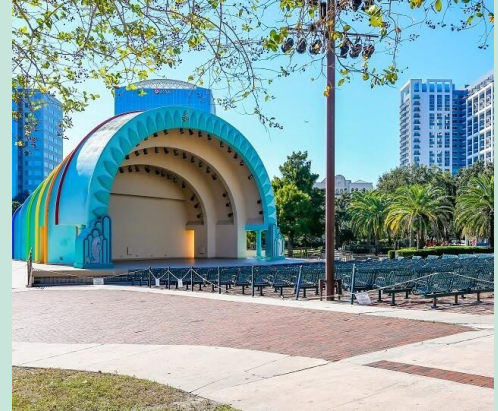
Spring Fiesta in the Park 2025 HOME | fiestainthepark