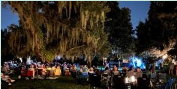
Jazz & Blues Concert Leu Gardens