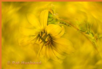
Creative – Lost in the Yellow Swirl by Pat Husband