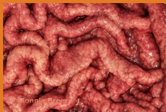
Color B – Stellar Stomach by Bonnie Breeze