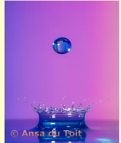
Creative – A Drop in the Crown Bucket by Ansa du Toit