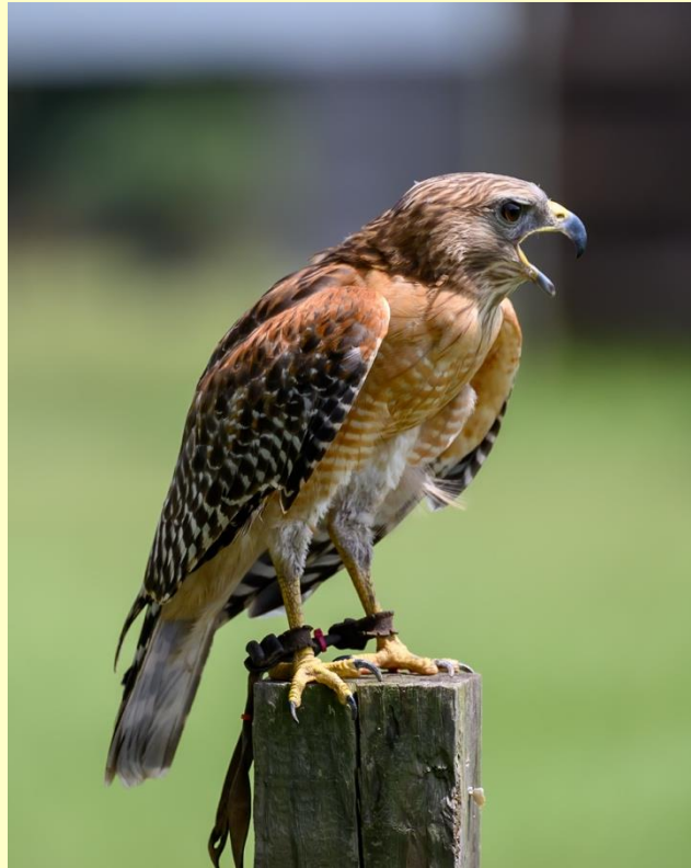
Taken at ARC

We are heading back to ARC (Avian Reconditioning Center) in Apopka to photograph raptors! We were last there 2 or 3 years ago, and it was a great success! It's so special to see these raptors up close! There will also be a demonstration of a bird in flight. Learn more at their website: