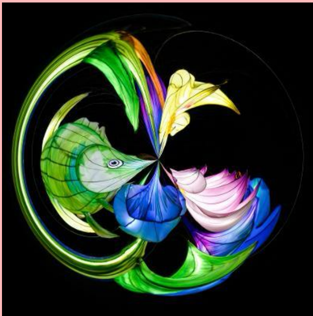
"Fish Out of Water"